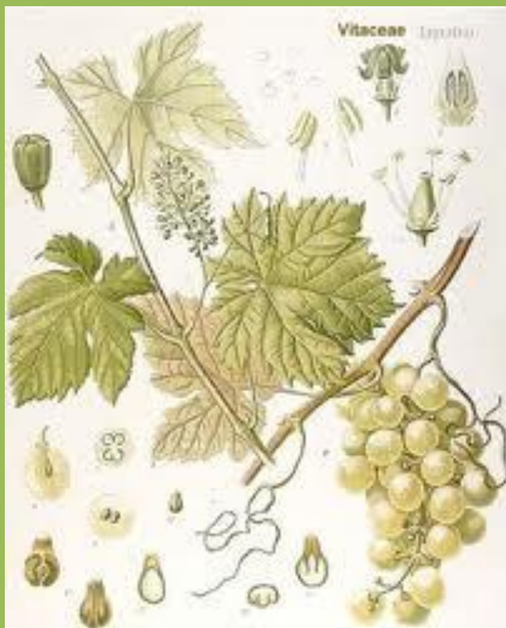
VID (Nombre español)